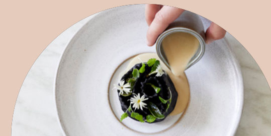
RAES AT WATEGO